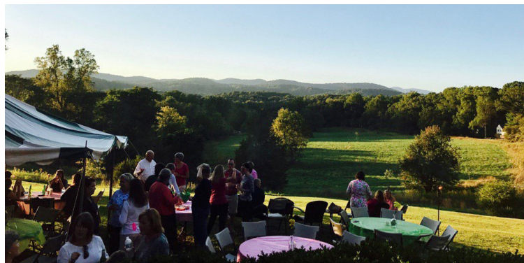
Conference participants enjoyed one of the most beautiful views on campus from the backyard of Hubbard House, where Alumnae Relations and Development hosted a picnic.

Participants have been encouraged to contact members of Alumnae Relations & Development staff or Alliance Council members as they begin to incorporate training into their club and class activities. The conference sessions provided opportunities for interaction with a wide variety of alumnae from different decades and geographic areas and were information packed, intense and fun! Stay tuned next year for a bigger and better Alumnae Leadership Training Conference on Founders' Day Weekend 2018 (September 21-23) with even greater opportunities for learning how alumnae can support Sweet Briar! ■