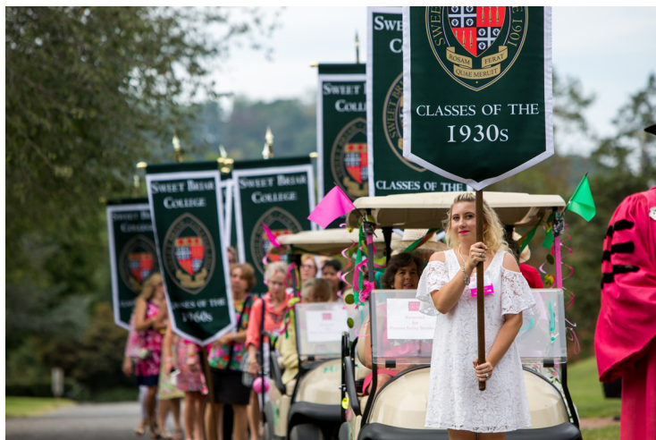
For President Meredith Woo's Inauguration, students led alumnae class representatives by their decades for the processional.