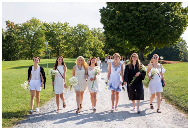
Students processed to Monument Hill on Founders' Day.