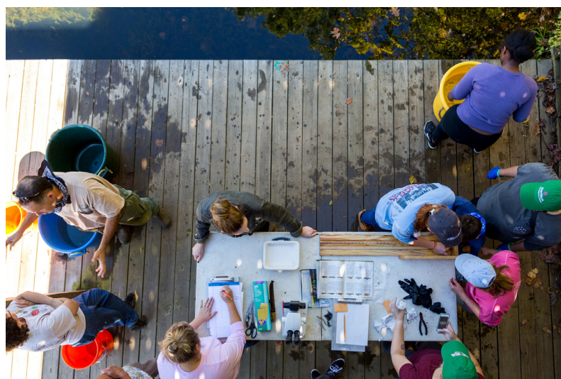
Sweet Briar students analyze the fish population in the College's lake.

Environmental science is one of Sweet Briar's most prestigious programs and this generous grant will not only help educate our students today, but will lay a foundation for the program's future. To make a donation in support of the College's Environmental Science Program and help ensure that we meet the full match, please contact us at 800-381-6131. ■