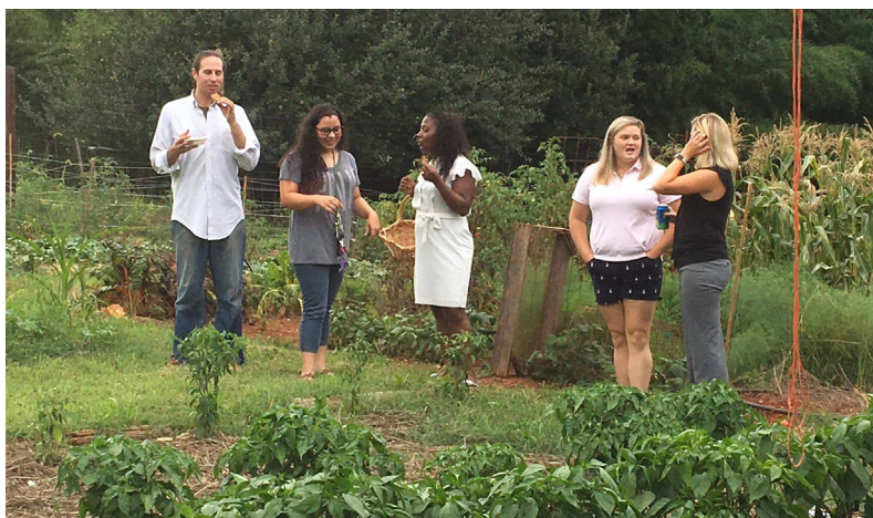
Sustainability interns and community members gathered in the Sweet Briar Community Garden before a celebratory dinner this past summer.

In early 2016, the Judith Haskell Brewer Fund of The Community Foundation Serving Richmond and Central Virginia awarded Sweet Briar College a grant for its environmental science program and community garden.