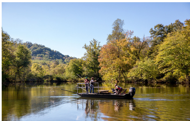
Students in the Ecological Resource Assessment course conduct research on Sweet Briar's lower lake.

The Brewer Fund has been providing the matching funds for each $100,000 raised by the College. As of June 2017, the College had raised more than $305,000 in matching funds and received $300,000 in matching funds from the Brewer Fund. Since June, an additional $17,500 had been raised toward the release of the Brewer Fund's fourth payment. The College needs to raise the remaining $177,500 by June of 2019.