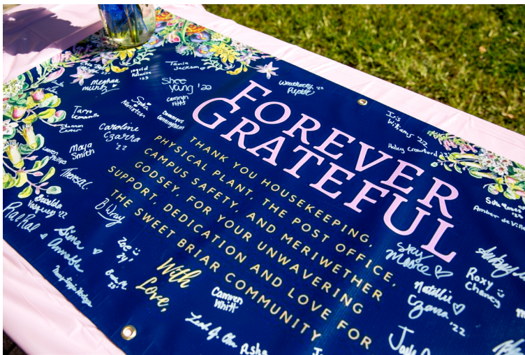
Students designed and signed a banner to show their gratitude for Sweet Briar's front line staff.

Sweet Briar's mission is to prepare young women "to be productive, responsible members of the world community." As part of their education outside of the classroom, the Office of Alumnae Relations and Development assisted by Student Life organized Philanthropy Week which began Sunday, Sept. 27 in the community garden on campus and finished with a G.L.O.W. Color Fun Run supporting local food banks. The purpose of the week was to show how Sweet Briar itself has been impacted by philanthropy, and also, to show students how they can impact Sweet Briar and the greater community through their time, talent, and service.