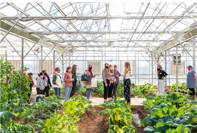
Students and their families had many opportunities to tour different areas of campus, including the greenhouse, riding center, museum, and a tour of the entire campus.