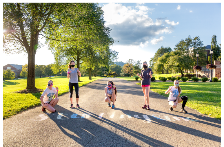
Student organizers at the starting line of the Color Run.

The Color Run was an evening filled with spirit and color fun. The G.L.O.W. club members volunteered and doused every runner and walker with a cloud of color powder. Throughout the week and especially for the Color Fun Run, community members were encouraged to bring non-perishable food items for two local food banks. Directly following the run, AR&D hosted "Hocus Pocus" in the Fitness and Athletics Center and gave every student a movie-themed snack bag.