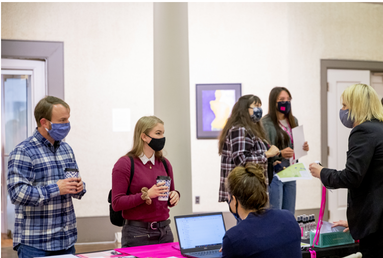
Prospective students and their families checked in at Pannell Gallery, bringing them through the center of campus on their arrival.