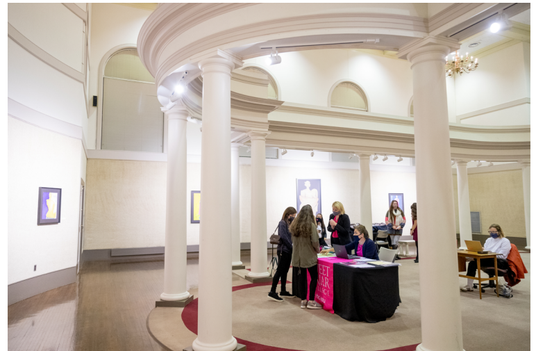
As they checked in, students walked through the exhibition "Through Her Body," a display of figurative works by Anne Doolittle '78.