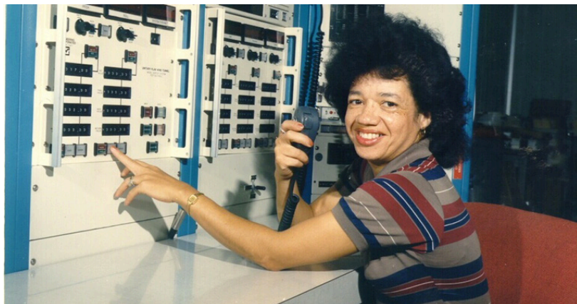
Christine Darden.

Tickets are $35 general admission, $25 for college students with I.D., and $15 for high school students with I.D. Reserved tables for eight in a priority location and with custom signage are also available for $350.