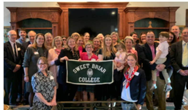
New Jersey & New York

From December through February, alumnae clubs around the United States came together to celebrate with each other, current students, parents, retired faculty and staff, and friends of the College. This year, 35 clubs came together for Sweet Briar Days to connect, relive fond memories of Sweet Briar, and remember the bond that we share in our love for this college.