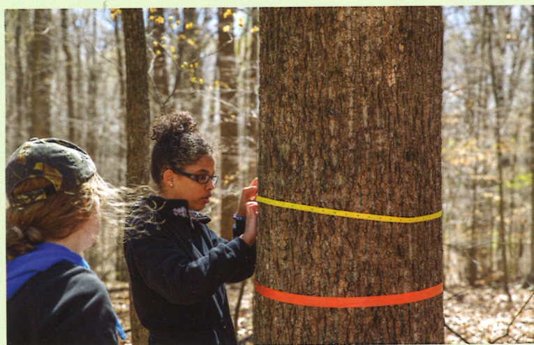
Participants in the Explore Environmental Science weekend.

Sweet Briar Athletics also hosted its first golf scramble at Poplar Grove, the local course in Amherst that is also the final design of golf legend Sam Snead. Ten foursomes participated in the scramble, complete with golf carts decorated in pink and green.