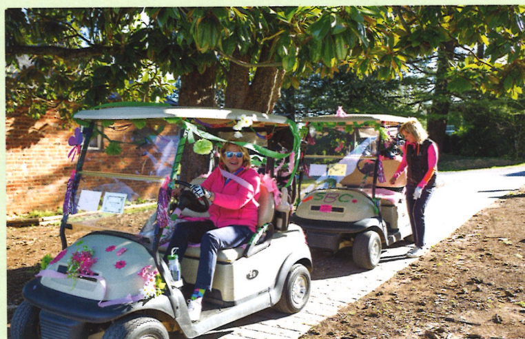
Getting ready for a great day during the first golf scramble at Poplar Grove Course located across from the College.