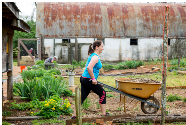
Students, faculty, staff, and community members volunteered for a workday in the Sweet Briar Community Garden on Earth Day.