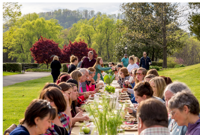
The Sweet Briar campus community gathered for a celebratory Earth Day dinner along quad road. Food service providers Meriwether Godsey used locally-sourced ingredients for the meal.