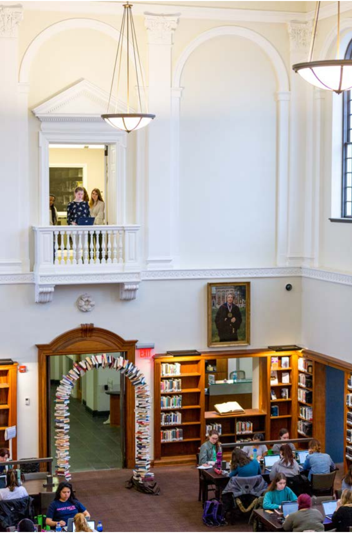
Students in CORE 130, Women and Gender in the World , use the balconies in Mary Helen Cochran Library to practice debate.

death experience breeds bold innovation. It is clearly not in spite of its major existential crisis, but rather because of it, that Sweet Briar has emerged as a remarkably forward-thinking and daring player in the field of leadership education and development. Two years after its shocking closure announcement and subsequent rescue, Sweet Briar unveiled a core curriculum focused on examining and defining women's leadership in the twenty-first century with an emphasis on experiential learning and core courses such as Decisions in a Data-Driven World and Sustainable Systems .