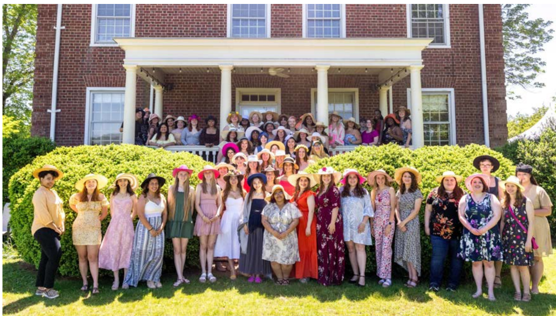
The Class of 2022 at this year's Fancy Hat Brunch.

green. We became more sustainable, and ladies, we did it all together."