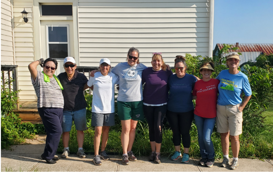
One of the Sweet Work Weeks crews showing off their hard work on Farmhouse Road.